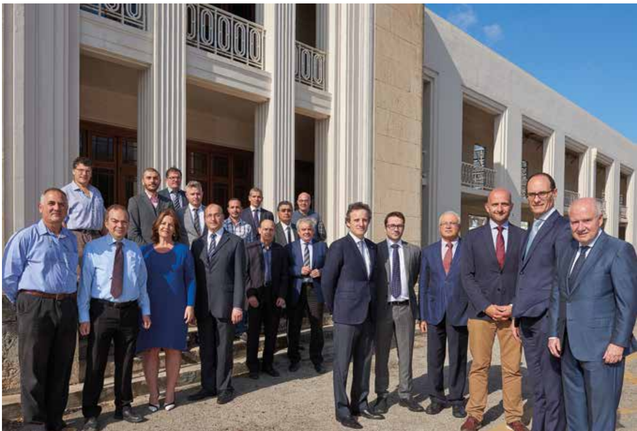
Trident Park Project Team

We are confident that we will rise to the challenges that await us, and are determined to hold service excellence as one of the core values that guide our endeavours. Our focus remains set on delivering a prestigious, efficient and distinctive project that will ensure maximum shareholder returns.