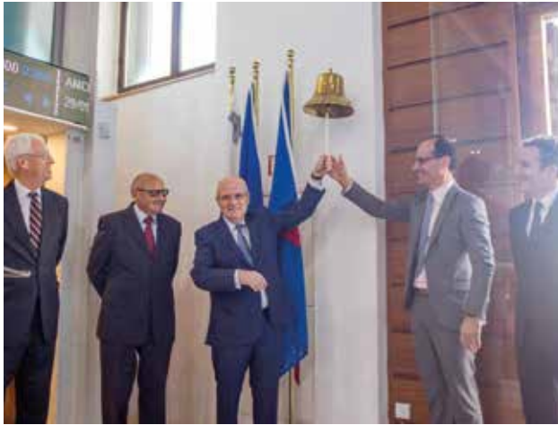
First trading session on the MSE – 31 January 2018.