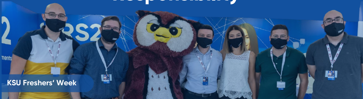
KSU Freshers' Week