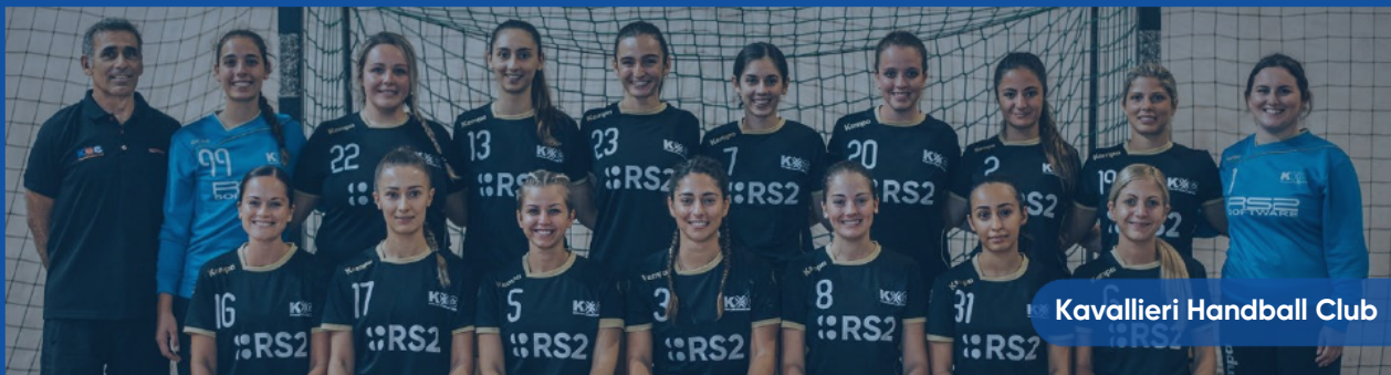
Kavalleri Handball Club