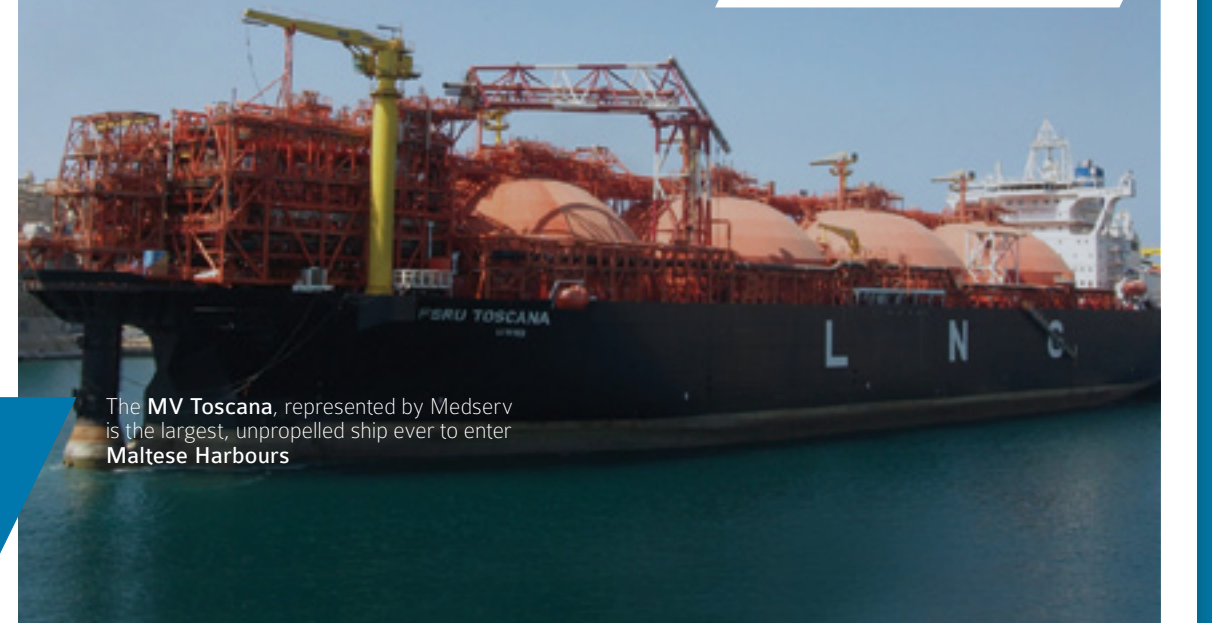
The MV Toscana , represented by Medserv is the largest, unpropelled ship ever to enter Maltese Harbours