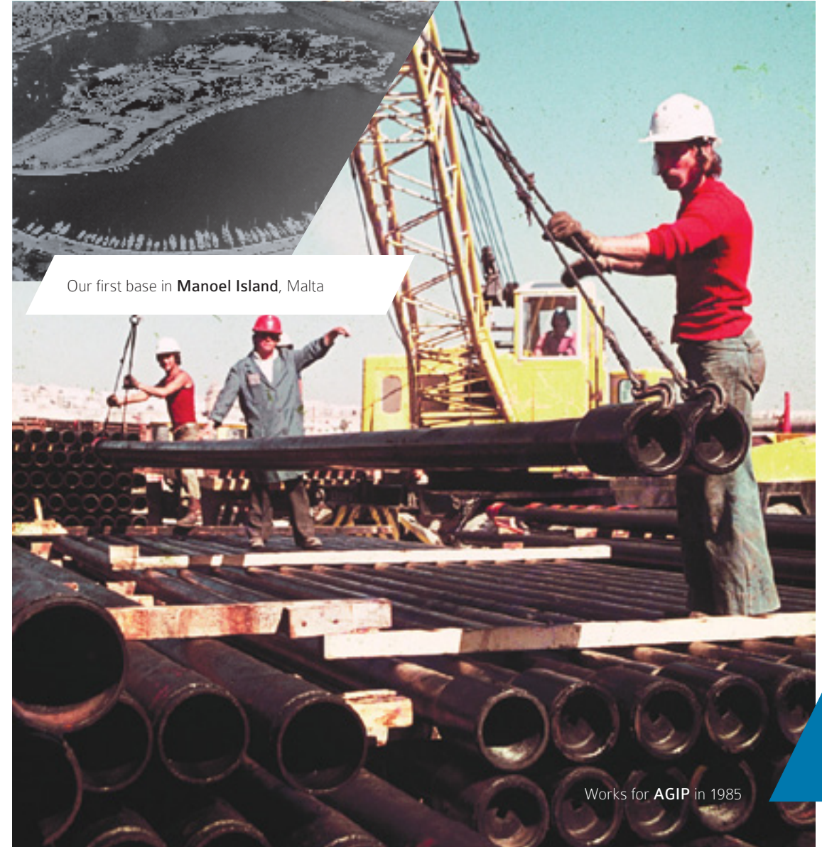
Our first base in Manoel Island , Malta

Medserv also obtained its ISO9001:2008 accreditation from Moody and has a documented Quality Management System fully endorsed by the company's top management.