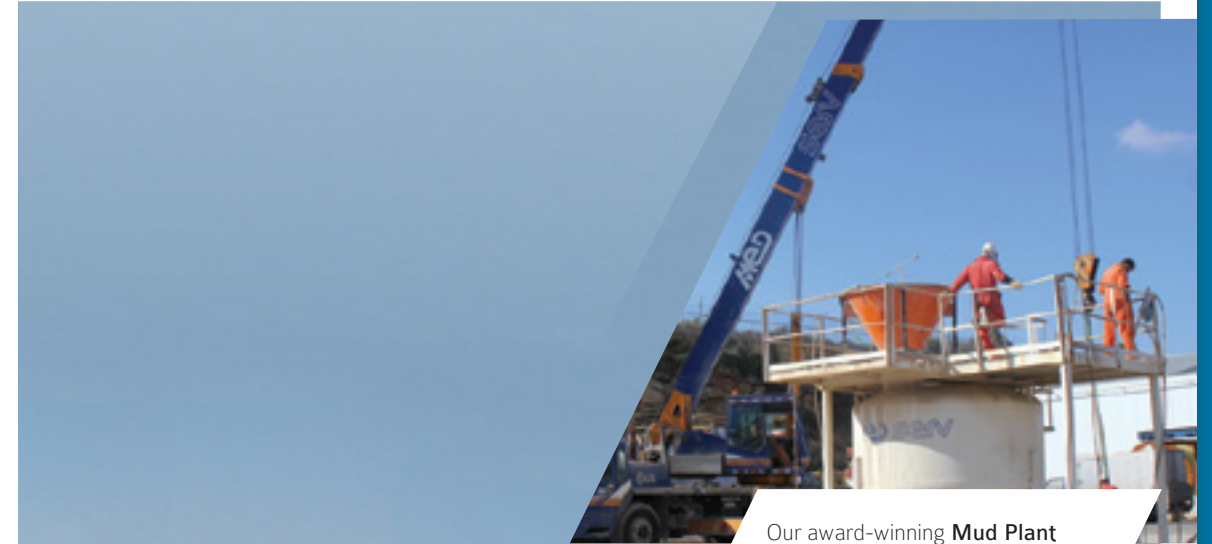
Our award-winning Mud Plant