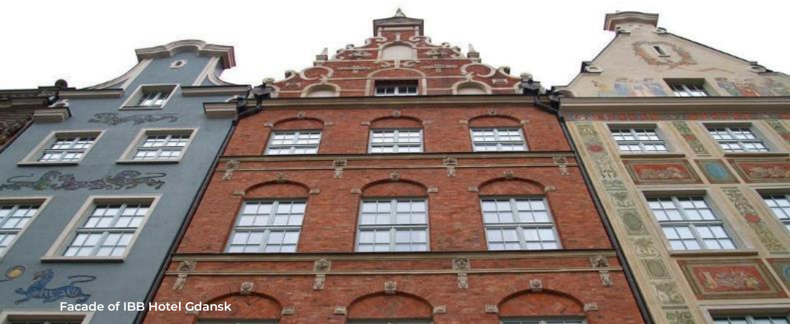
Facade of IBB Hotel Gdansk

In 2022, the Group, through its subsidiary TIMAN Investments Espana SL, acquired a commercial mixed-use property located in the prominent location along the main yachting marina promenade within the harbour of Mahon, Menorca in Spain. In early June 2023, the Group opened the Hammett's Mestizo Menorca restaurant, which adopted the Hammett's branding as a testament to the Group's confidence in the brand. This establishment marks the first Hammett's restaurant outside of Malta, further expanding the brand's presence and catering to a new market of discerning diners. Additionally, the Group is actively seeking tenants to occupy the remaining commercial space, which offers diverse opportunities for retail outlets or residential use on the upper floors. The target revenue of the property once operational is expected to be in the range of €180-€200k per annum.